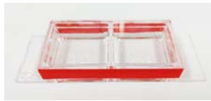
Figure 1. When taking images through confocal microscopy, the image chamber must be seal by label tape.