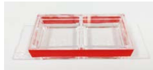
Figure 2. When taking images through confocal microscopy, the image chamber must be seal by label tape.